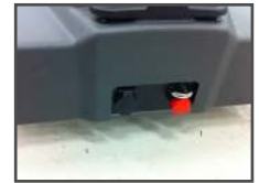
Foot activated emergency stop button and magnetic charger port.