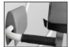
Comfortable back rest made of a soft and durable material that is easy to clean.