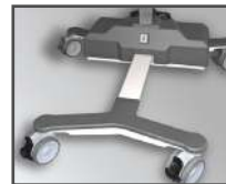
Low and narrow chassis that easily maneuvers under beds and bathtubs.