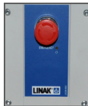
Emergency lowering button